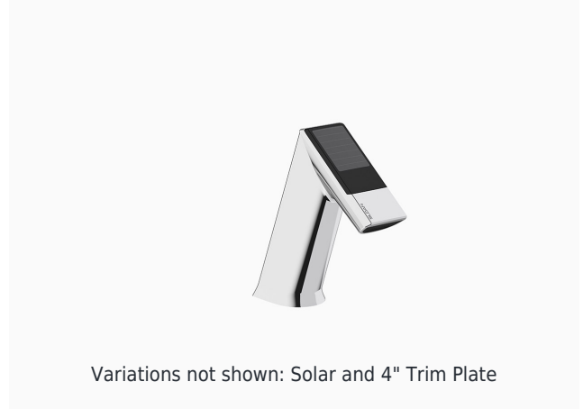
Variations not shown: Solar and 4" Trim Plate